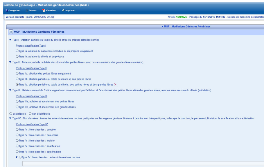
Fig. 2 FGM/C type and description in the gynecological electronic medical chart

the calculated prevalence of FGM/C among 4163 inpatient women in obstetrics and gynecology is only 4.68%.