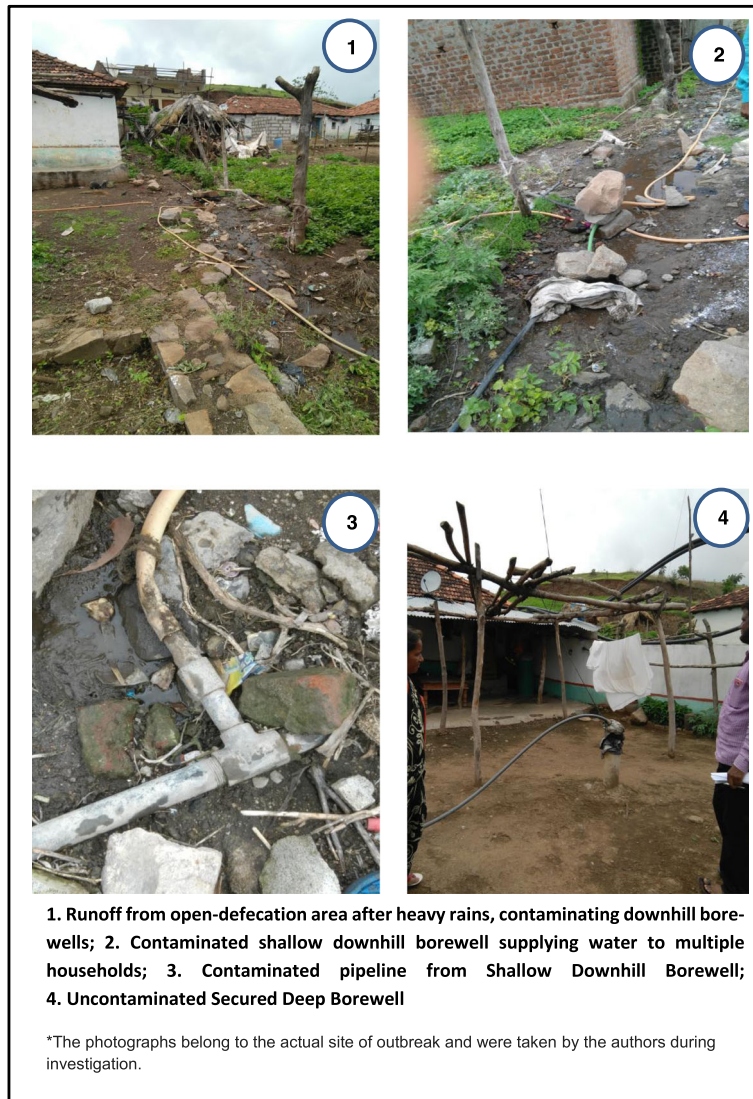
Fig. 3 Photographs of Open-Defecation site, Downhill Shallow Bore-wells and a Deep Borewell, in Acute Diarrheal Disease Outbreak in Pedda-Gujjula-Thanda Village, 2017*

2012, investigation revealed a waterborne viral gastroenteritis outbreak with a point source pattern, due to consumption of heavily contaminated water from a tap, which was not in use for two weeks during Christmas vacation [12].