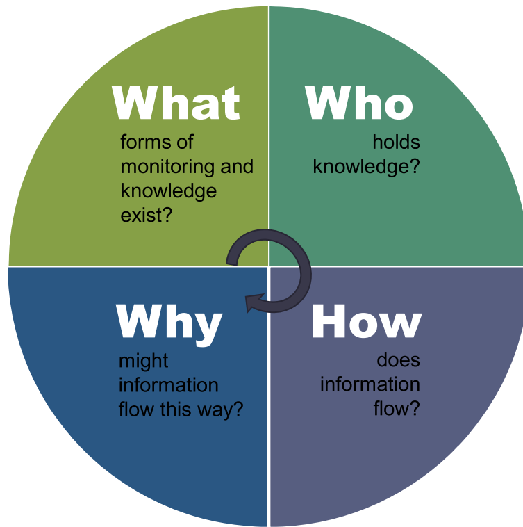
Fig. 2 Four components used to inform the surveillance initiation and problem definition in a place-based integrated climate-food-health surveillance systems

knowledges and systems as a key part of understanding community-based surveillance processes [63]. Similarly, Schneider and Lehmann (2016) highlight the need to map knowledge holders and key actors within the community health system, as well as the relationships between them “...as they will shape what can be achieved in [and by] communities and will therefore need to be understood and engaged” [62].