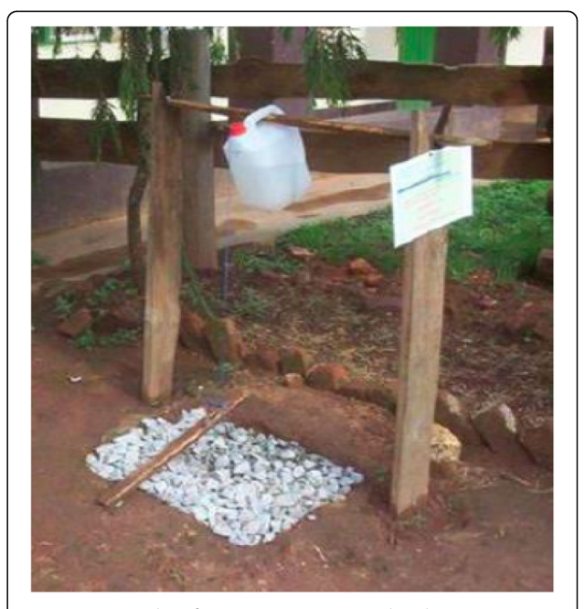
Fig. 2 An examples of a tippy-tap.