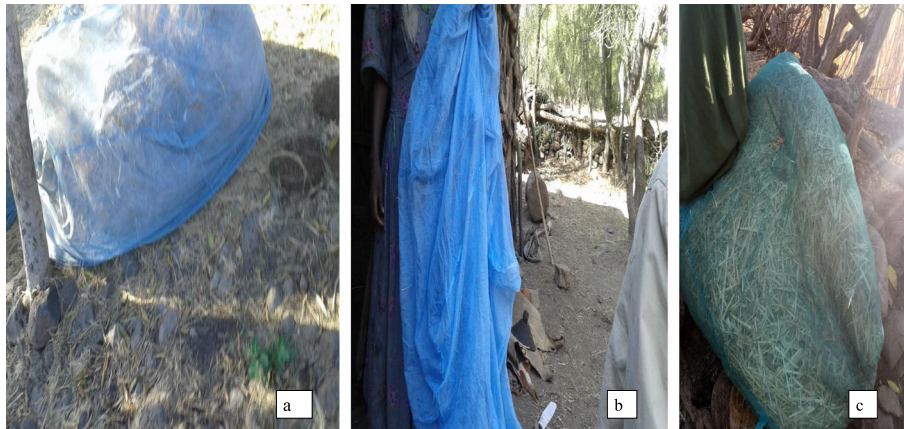
Fig. 3 Misuse of new LLINs: a) Used for protection of tef ( Eragrostis tef ) straw from herbivore domestic animals. b) Put as packed in its plastic bag. c) Used as a sleeping foam by filling with straw

Suggestion by informants indicated that information, education and communication (IEC) and behavior change communication (BCC) interventions should always go along with distribution of LLINs and during the active life span of nets in communities’ utilization. Informants recommended improving the effectiveness of LLINs by replacing them every year or 2 years, re-impregnating them every 6 months, or increasing the amount of insecticide used. Prolonging the ability of LLINs to kill fleas and bedbugs was said to increase persistent use.