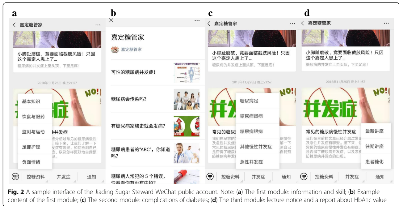
Fig. 2 A sample interface of the Jiading Sugar Steward WeChat public account. Note: (a) The first module: information and skill; (b) Example content of the first module; (c) The second module: complications of diabetes; (d) The third module: lecture notice and a report about HbA1c value

of family members, patients may practice DSM with more confidence.