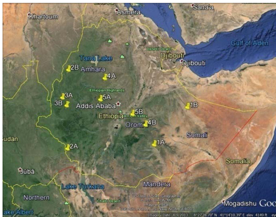
Fig. 2 Map of Ethiopia showing study sites selected in each Ecological Zone