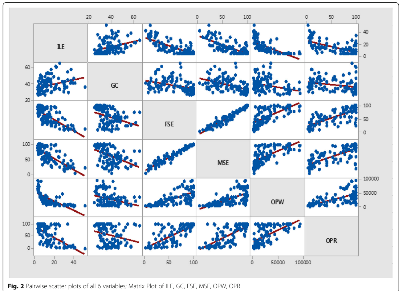
Fig. 2 Pairwise scatter plots of all 6 variables; Matrix Plot of ILE, GC, FSE, MSE, OPW, OPR

Table 1 presents descriptive statistics for the ILE ranges between countries and the values of socio-ecological indicators. ILE ranged from 2.8% in Iceland to 51.2% in Sierra Leone. The mean ILE was 14.82%, with a spread of 48.4%.