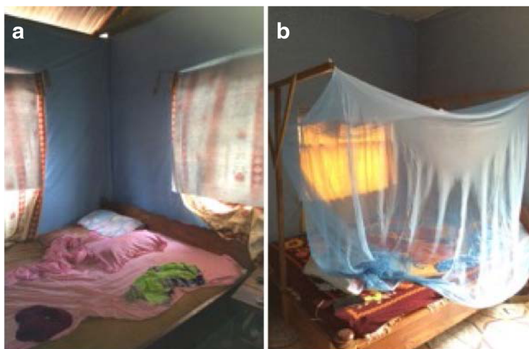
Fig. 3 a PermaNet® Lining. b Interceptor® LLINs

ITWL installation is scheduled to begin in all buffer areas in late August 2015, to allow study teams the opportunity to remedy any unforeseen technical or logistical problems before installation in core households. ITWL installation will be rolled out in tandem with cohort recruitment. The order in which intervention clusters will receive ITWL installations will be randomized; once all eligible cohort members have been recruited in an intervention cluster