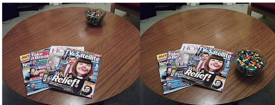
Fig. 2 Snack food presentation. The left image shows the distal condition and the right image shows the proximal condition during the relaxation break. Images are taken from the participant's perspective

Calculated from any difference in bowl weight from before to after the relaxation break.