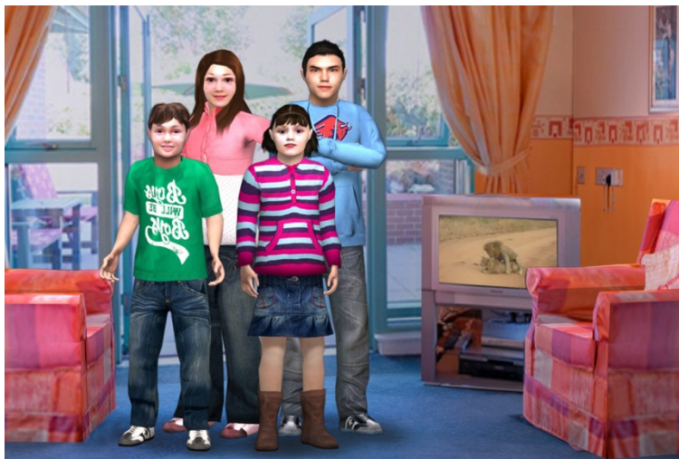
Table 3 "What Should We Tell the Children?" game summary

The game provides parents with realistic scenarios of sex and relationships communication with their children, all based around a virtual house. Once registered, players are then able to select from two versions of the game – one for parents of younger children (aged 5–9) and one for older (aged 10–14). Both versions have similar content and the same gameplay, with slight dialogue differences to reflect the nature of conversations at different ages. The game is a first-person role play, with players proceeding through rooms of a virtual house and talking to 'their children'. In each room they are faced with a different situation such as children asking awkward questions or finding objects of concern in their room (e.g., messages on social networking sites). Scenarios include: