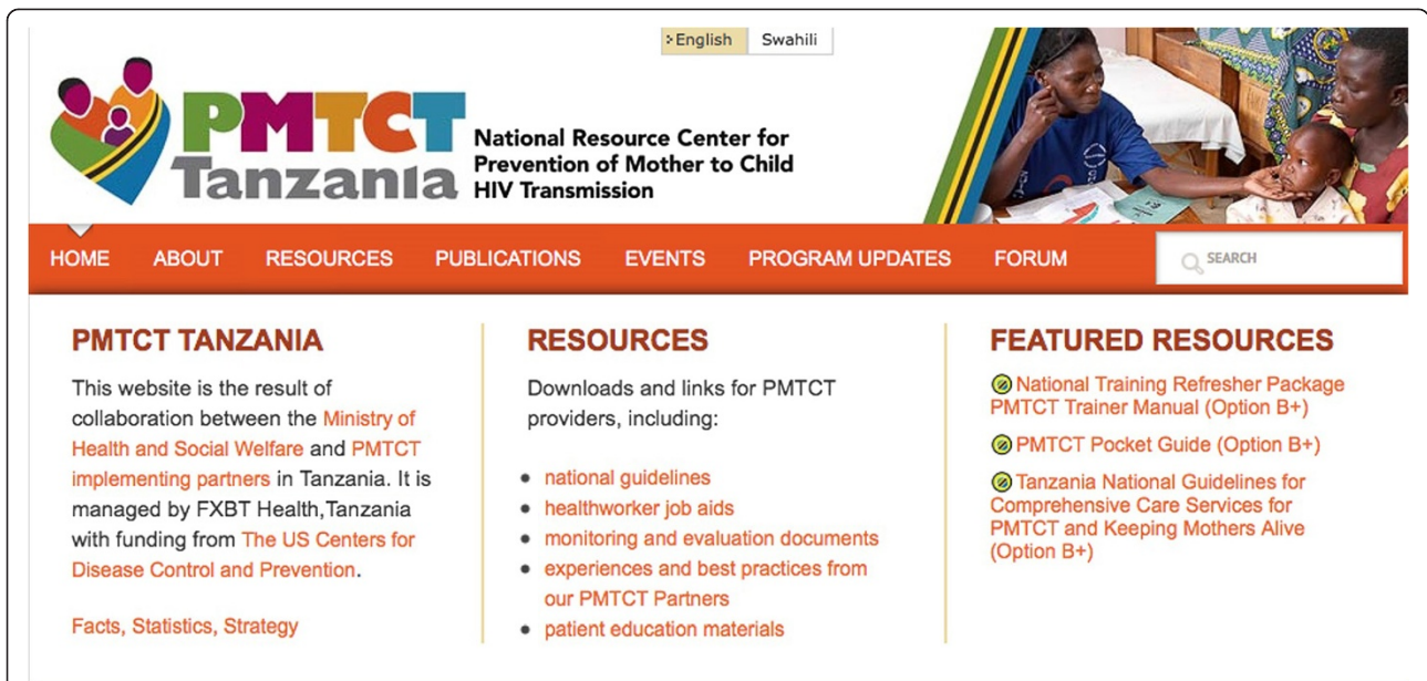
Fig. 1 Tanzania PMTCT website homepage. The Tanzania Prevention of Mother-to-Child Transmission of HIV National Resource Center website home page ( http://pmtct.or.tz/ ) header, illustrating some of the resources available on the website. The image on this figure was purchased with the following Rights Granted defined on the paid invoice: RIGHTS GRANTED: For EDITORIAL (NON-COMMERCIALS) USE ONLY. 100,000 maximum prints or impressions (including collateral and multimedia uses). Unlimited use on one Website permitted. Worldwide distribution permitted

From July 2013 through June 2015, 50 % of website visits originated in Tanzania, with about two-thirds (62 %) from Dar es Salaam, which is mostly an urban area. About one-third (32 %) of Tanzania visits came from unspecified locations, and there were small numbers from Arusha, Mwanza and Zanzibar, which is consistent with limited internet access outside of urban centers. Visits that