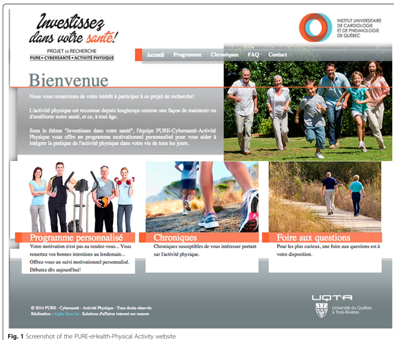
Fig. 1 Screenshot of the PURE-eHealth-Physical Activity website

In April 2014, potential participants received an email as an introduction package which contained a) an email letter from the two principal investigators (PP, GRD) of the Quebec City PURE study centre describing the