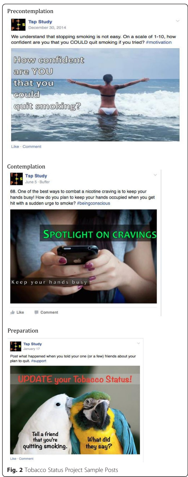
Fig. 2 Tobacco Status Project Sample Posts

Participants in the control condition, receive a referral to the National Cancer Institute’s Smokefree.gov website. This website, created by the Tobacco Control Research Branch of the National Cancer Institute, provides information and support to quit smoking for people at all stages of