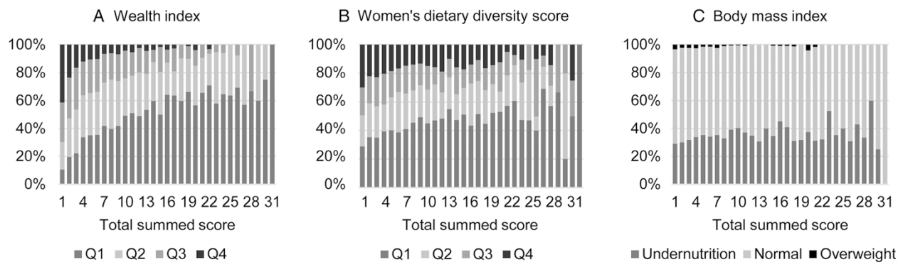
Fig. 3 The relationship between the summed food insecurity score and the indicators of household food insecurity: (a) wealth index; (b) women’s dietary diversity score; and (c) women’s body mass index (Q1: 0-25 th percentile; Q2: 25-50 th percentile; Q3: 50-75 th percentile; Q4: 75-100 th percentile)

The total summed score of dichotomized items was validated against common food insecurity comparators such as poverty, food consumption, adult BMI and child malnutrition under 12 years old [13]. In our study, we also observed external validity between the total polytomous score and similar food insecurity indicators. The strong association