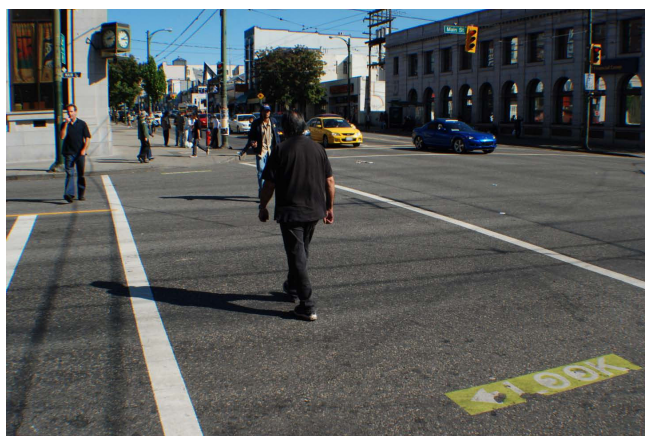
Figure 2 Intersection at Hastings and Main Streets.

The absence of marked and signalized pedestrian crossings at all but one midblock location is of particular concern. Well-marked crosswalks with a pedestrian-controlled signal can reduce pedestrian-vehicle conflicts [33]. Another option that has been shown to be effective at midblock locations are non-signalized crosswalks with in-pavement lights that flash when a pedestrian is present [34]. These were not present at any of our hotspot locations. The midblock location on Hastings St. between Columbia and Main was by far the highest ranked incident location (Figure 4). This is one of the main areas of the DTES where large groups of homeless people congregate, and is also the precise location of Insite, the government-sponsored controlled safe drug injection facility. These are likely factors in the disproportionately large number of pedestrian-vehicle collisions at this location; however, no crosswalk, traffic-calming measures, or pedestrian safety interventions are in place at this mid-