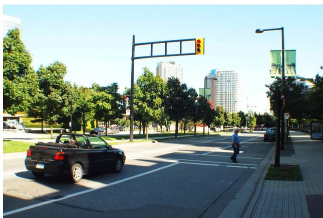
Figure 5 A signalized crosswalk and median at a midblock location on Expo/Pacific Blvd.

whether alcohol was a definitive explanation for the correlation between bars and injuries. However, there is ample reason to suspect that this is the case and policy should proceed accordingly.