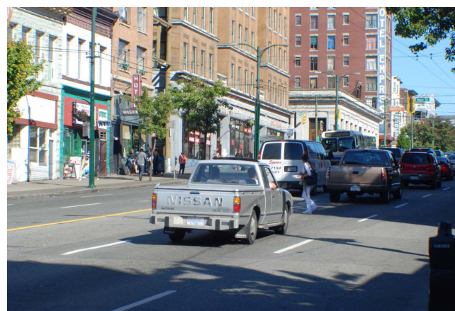
Figure 4 The midblock location on Hastings St. between Columbia and Main.

Alcohol consumption by pedestrians is a recognized factor influencing their risk of collision with a vehicle; however it is often overlooked as an issue in comparison with alcohol consumption by drivers. Recent consumption of alcohol is common in injured pedestrians, and it has been shown that the severity of injuries is frequently greater for this group [35]. The high incidence of injury in alcohol-affected pedestrians may in part be due to the effects of alcohol on the pedestrian's ability to judge gaps in the traffic for safe road-crossing [36]. Pedestrian injury hotspot locations are often in areas with a high density of bars and other alcohol serving establishments. In a spatial analysis of pedestrian injury in San Francisco, LaScala et al. [37] discovered that pedestrian injury was highest in areas with the greatest density of alcohol serving establishments, for incidents where the pedestrian had been consuming alcohol. The results of the present study indicate that bars were located immediately proximal to two-thirds of the hotspots, with almost one-third located in high density bar and alcohol serving establishment areas. Since pedestrian injury patients' alcohol levels are not consistently included in the BCTR, we were unable to gauge