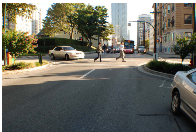
Figure 3 A location with a corner bulge in place.

The absence of marked and signalized pedestrian crossings at all but one midblock location is of particular concern. Well-marked crosswalks with a pedestrian-controlled signal can reduce pedestrian-vehicle conflicts [33]. Another option that has been shown to be effective at midblock locations are non-signalized crosswalks with in-pavement lights that flash when a pedestrian is present [34]. These were not present at any of our hotspot locations. The midblock location on Hastings St. between Columbia and Main was by far the highest ranked incident location (Figure 4). This is one of the main areas of the DTES where large groups of homeless people congregate, and is also the precise location of Insite, the government-sponsored controlled safe drug injection facility. These are likely factors in the disproportionately large number of pedestrian-vehicle collisions at this location; however, no crosswalk, traffic-calming measures, or pedestrian safety interventions are in place at this mid-