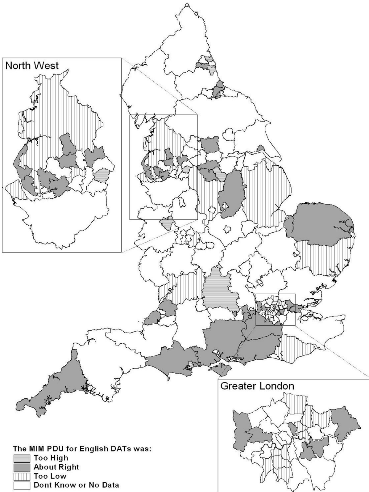
Figure 1 Drug Action Teams' perception of the Multiple Indicator Method (MIM) estimate of problematic drug use (PDU).