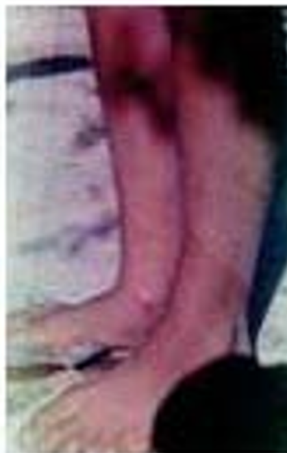
Figure 1 Maculopapular rash on hands and feet in cercarial dermatitis.