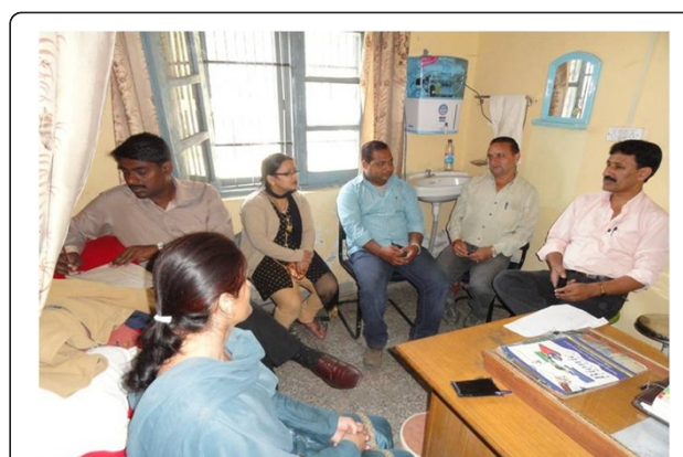
Figure 2 Interaction with health officials involved during 2002 Plague outbreak in Himachal Pradesh, India.

From the present study, the fact emerged that hunting is mostly done during winters in the dense forests e.g. Mural Forest. Hunting is called 'Adecka'. Some of the residents have guns and a few have specially trained dogs for hunting purposes. Very few people have licensed guns and the rest use unlicensed guns or other tools for killing purposes even though all these are strictly banned by the government. People go in groups of 10–12 and stay there in 'udaar' (caves) or tents. This is their way of relaxation. They seemed to hide the details on this issue from investigators due to the so-called 'ban on hunting'. Though banned, hunting by the men folk is likely to continue in a scattered manner in HP. Staying in the hills for days together increases their exposure to rats/burrows (in caves) (Figure 2).