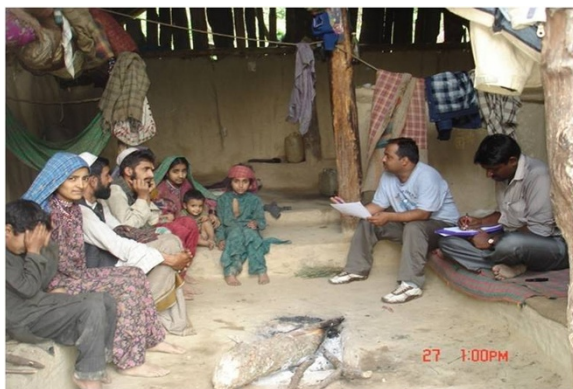
Figure 4 Life style of Gujjars (nomadic population) in the study area.

The study revealed that the outbreak in 2002 in a few villages of Himachal Pradesh was that of plague which occurred due to the contact of the index case with wild animals after hunting and de-skinning. However, it still