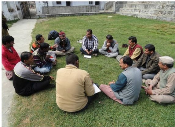
Figure 3 Focus Group Discussion with affected families and natives of villages affected during 2002 plague outbreak.

about the disease. They are aware that during plague, the body temperature shoots up. They call it a disease of cold (Thande ki Bimari). They believe that the plague outbreak starts when a person visits the forest for hunting where he consumes the meat of a bird and stays at a hunter's place. They have seen some red and some white colored rats. They know the sites of rat burrows. On request, they helped the team in catching them from their burrows. Wild rats are called "Punjali Chuhey" or "teer ki thand ka chuha" (the rat found in intense cold weather). Most of the Gujjars, follow a primitive lifestyle and live in "kutcha" hutments (thatched). They abandon their hutments also known as "deras" when they leave for Uttarakhand (Figure 4).