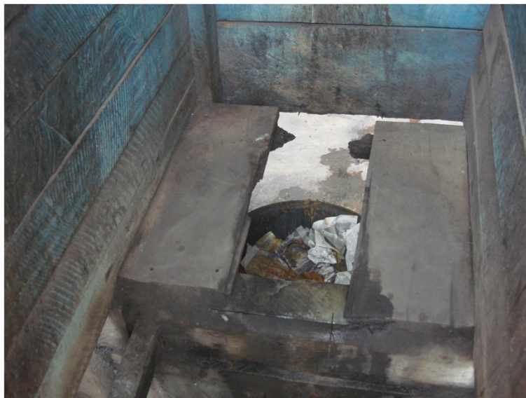
Figure 3 A bucket latrine: banned but still in existence. The latrine is a public toilet in one of the neighbourhoods.