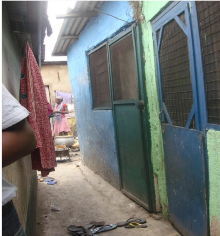
Figure 2 A multi-tenement structure in an informal settlement. Single windows on only one side of the building result in poor ventilation. Single rooms are occupied by families and lack privacy.