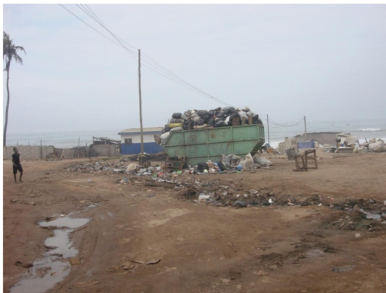
Figure 5 A skip at a communal collection point for refuse disposal in one of the neighbourhoods. The skip is located a short distance from residential dwellings. Wind draughts from the beach blow in malodorous air towards the dwellings.

complaints known to be associated with poor housing quality (see Figure 6). It is surprising that despite poor environmental quality and a high prevalence of illness in the surveyed neighbourhoods, only 5% of respondents rated their health as poor. This may be related to the short duration of some of the illnesses assessed. Since four of the five neighbourhoods were urban areas with relatively better access to health care facilities and basic amenities, it is possible that restoration to health was swift or illness was less debilitating. Consequently, respondents had a positive view of health especially if they were not sick at the time