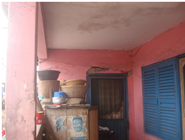
Figure 6 One of the houses in poor repair status. The house has cracks in the walls, a torn door net, and electrical wiring hanging off the walls.

of interview or if illness did not limit physical or economic activity. Although health outcomes were different, Fink et al. [26] noted a similar positive view of health among respondents [26]. In a study investigating slum residence and health among adult women in Accra, the authors found positive health outcomes and suggested a self-selection theory where women found in informal settlements are more driven, optimistic and tend to have a more positive view of their health [26]. They also suggested that because these women were generally in stronger health, environmental factors tend to have less impact on health [26]. The difference in health outcomes between the two studies may be due to different methods employed in assessing health outcomes.