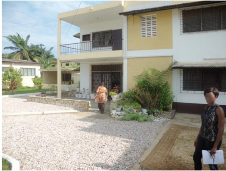
Figure 4 A duplex in a middle income neighbourhood. A family house in a neat, well-kept compound in one of the urban neighbourhoods.

to enable them address nuisances effectively without undue interference. Monitoring mechanisms for housing quality other than periodic demographic and health surveys can offer hypothetical explanations for disease profiles observed in local health facilities. In turn, such reports alert relevant authorities to situations requiring further investigation and priority attention for remediation and prevention of potential outbreaks.