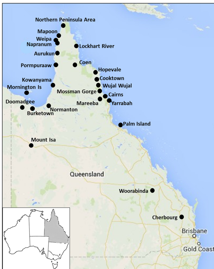
Figure 1 Indigenous communities and towns in Queensland affected by Alcohol Management Plans.

Additional people can be employed on a casual basis during visits to discrete communities; these community members act as local facilitators within the community. The majority of staff members have prior experience and qualifications working with Indigenous community members or in remote Indigenous communities in Queensland and in other Australian jurisdictions.