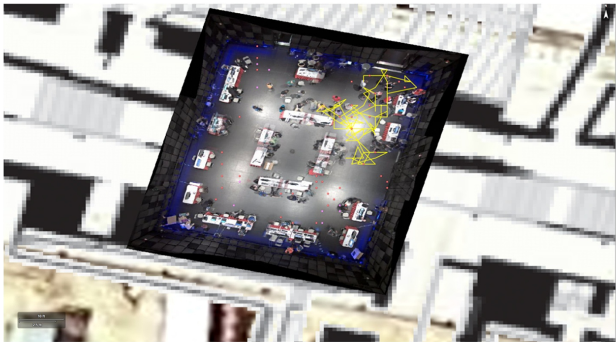
Figure 2 Snapshot of simulation of 2013 GameFest event (Studio 1), Rensselaer Polytechnic Institute, Troy, NY, April 2013, using IMPACT computer application. Yellow tracks reflect random mixing of a sample of participants at one-second intervals during a three-minute video clip. Participants were introduced using a uniform X:Y distribution from their starting point, with proximity between participants determined by each participant's random direction (0 to 360 degrees) and step size based on a Gaussian distribution. Physical barriers in Studio 1 restricted participants' movements and contact with other participants.

video recordings are commonly used for security purposes at most public venues, there will be fewer concerns with privacy.