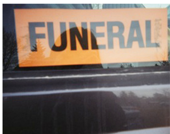
Figure 4 Funeral Sign. Represented smoking as a sign of cancer and death.

Whenever he smokes I'm like in a car with him or in the house with him. He's always supposed to go outside of the house to smoke, but when I'm in the car with him I roll down the windows so I don't have to breathe in the smoke and I just go on with him and like, "Okay, you can do whatever you want, then I'm just going to do what I want to do." [17-year-old male]