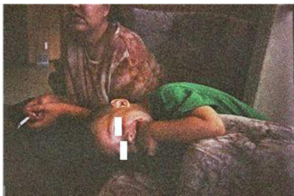
Figure 3 Adult smoking beside a young child. Represented parents "doing" to children; children have no choice.

Um, I'm pet sitting for a friend while she's in Florida and her parents are usually always smoking or getting ready to light another cigarette and so I went there it just smells so bad in their house and I feel sorry for her cause she's got a sister in kindergarten and it's her in grade nine and her parents are smoking and their