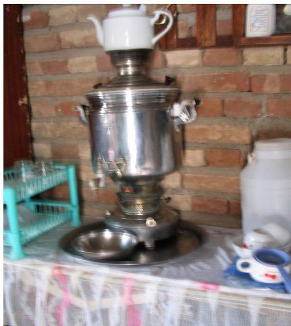
Figure 1 A samovar boiling water as well as holding a kettle on it to brew the tea.

traditionally used to heat and boil water in and around Russia, as well as in other Slavic nations, Iran, Kashmir and Turkey [15].