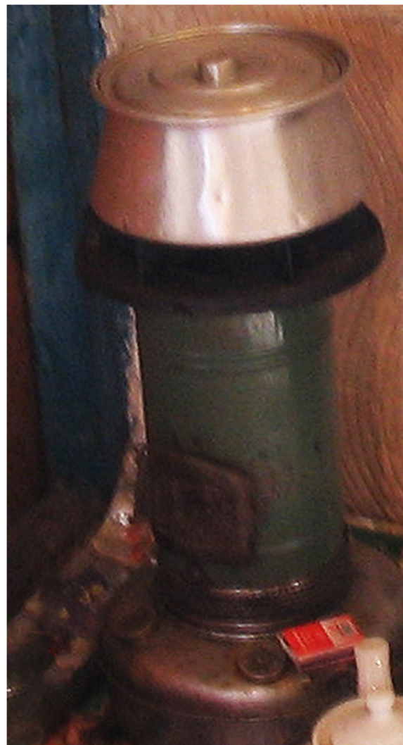
Figure 2 Valor, a traditional Iranian appliance, used both for cooking and making tea as well as heating the air.

To provide necessary power of study over preventable risk factors, cases were matched with controls on age, sex and urbanity through frequency matching method. Statistical analyses were done using STATA statistical software package (Release 11. College station, TX: stata Corp LP.). Both bivariate and multivariate analysis methods were used. An independent samples t-test was used to compare the means of normally distributed numeric dependent variables for two independent groups. The Wilcoxon-Mann-Whitney test was used as a non-parametric analog to the independent samples t-test when the normality assumption didn't hold. A One-Way Analysis of Variance was used to test the equality of three or more means. To assess the association of two categorical variables, such as study group and use of electric samovars, Chi-squared test was primarily applied. Fisher's exact test was used if the expected count limit assumption was not met. Also crude odds ratios were calculated and their 95% confidence intervals were reported. Associations with a p-value < 0.1 were considered to be adjusted in