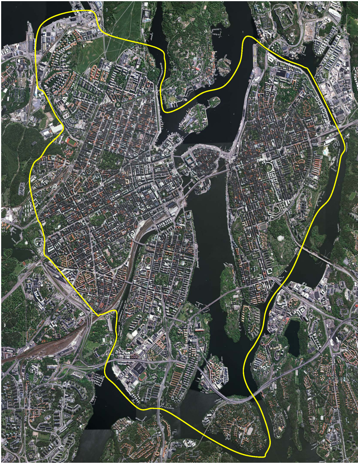
Figure 2 Aerial view from 2005 over the inner urban parts of Greater Stockholm, Sweden. The yellow line distinguishes the inner urban and suburban - rural parts. North is on the left of the image. For description of the characteristics of the study area, see Methods. (Copyright: Lantmäteriverket, Gävle, Sweden, 2011; Permission 81055230).