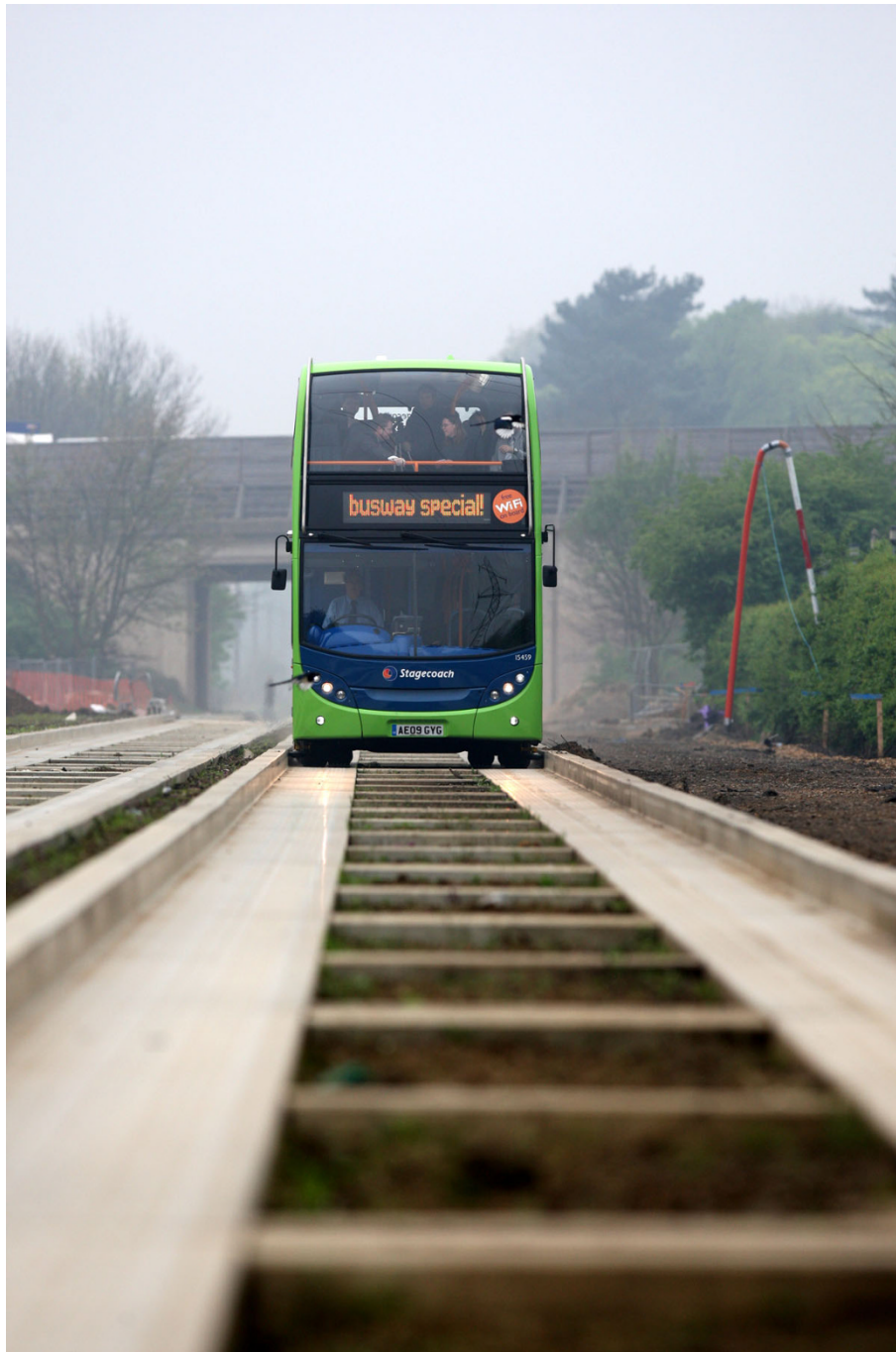
Figure 3 Bus on guided busway.

assumptions implicit in defining the boundaries of the 'intervention' and 'control' areas will subsequently be tested in two ways. First, the network distance from home to the nearest guided busway stop or access point will be entered as a covariate in analysis of the determinants of changes in travel behaviour in the cohort. Second, the results of two alternative approaches to analysis will be