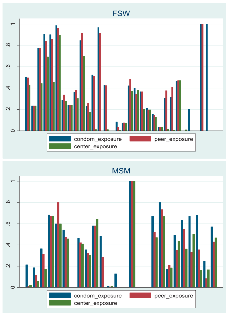
Figure 2 Dosage measures distributed across sites (histogram). Bottom: The x-axis represents sites and the y-axis represents percentages.

Regression analyses were conducted, adjusting all models for sampling design (using random and fixed-effects models by site). The logistic model results are