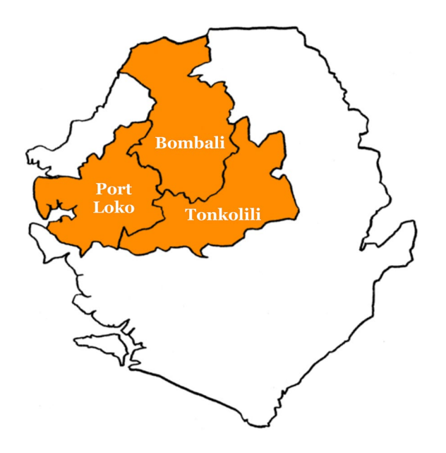
Fig. 1 Map of HHS districts in Sierra Leone

a cross-sectional community-based household survey (HHS) was designed to estimate baseline malaria prevalence and Perennial Malaria Chemoprevention (PMC; formerly named IPTi) coverage among children living in the selected project areas [15]. This implementation research project is currently ongoing and aims to maximise the delivery and uptake of PMC [16]. Inclusion criteria for the HHS were: (i) age 10–23 months and (ii) residence in a project district at the time of the survey. Caretakers of eligible children were interviewed after they had agreed to participate in the survey by signing an informed consent form.