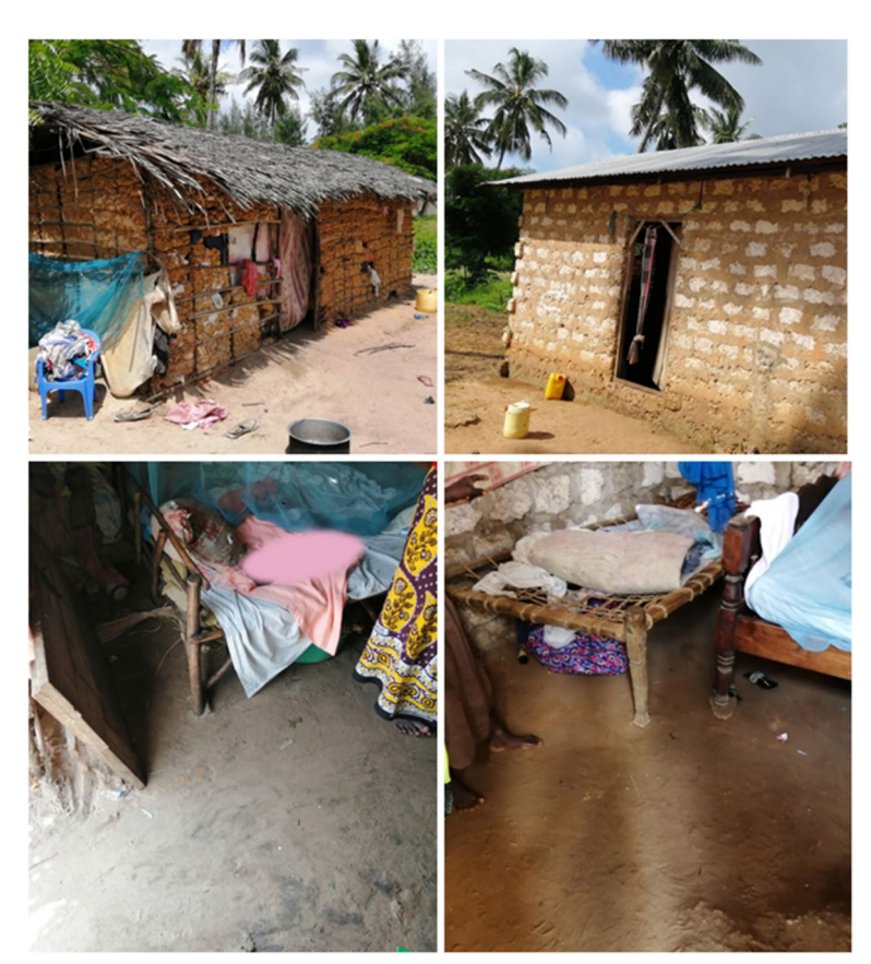
Fig. 1 Typical rural mud and brick houses with their unsealed earthen floors in the study area in coastal Kenya