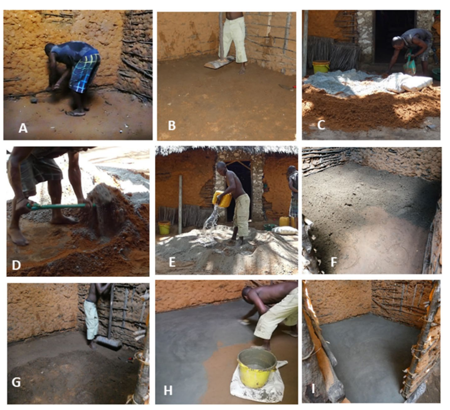
Fig. 2 Installation of the low-cost floor. A) Excavating the existing surface, B) Compacting the soil, C) Adding cement to local subsoil (1 part cement with 9 parts soil), D) Mixing cement with sub-soil, E) Adding water to the mix, F) Cement-stabilized soil laid on top of the compacted soil, G) Compacting the cement-stabilized soil, H) Spreading the "nill" finish (cement/water slurry), I) The completed floor

households with tungiasis infected residents. The heads of eligible households were invited to a meeting where the study was explained, including the randomization process and controls. All heads of households who signed the consent form selected their own study arm assignment using a paper lottery system for randomization.