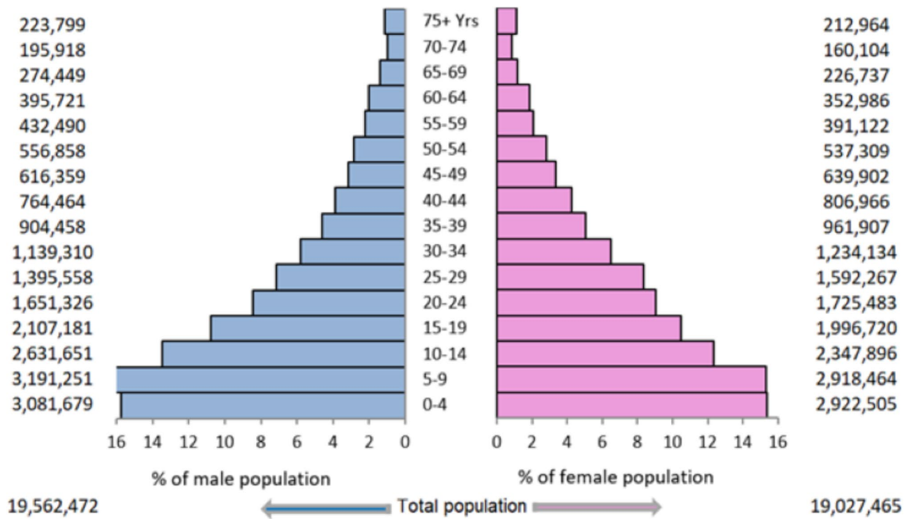
Correct version of Fig. 2