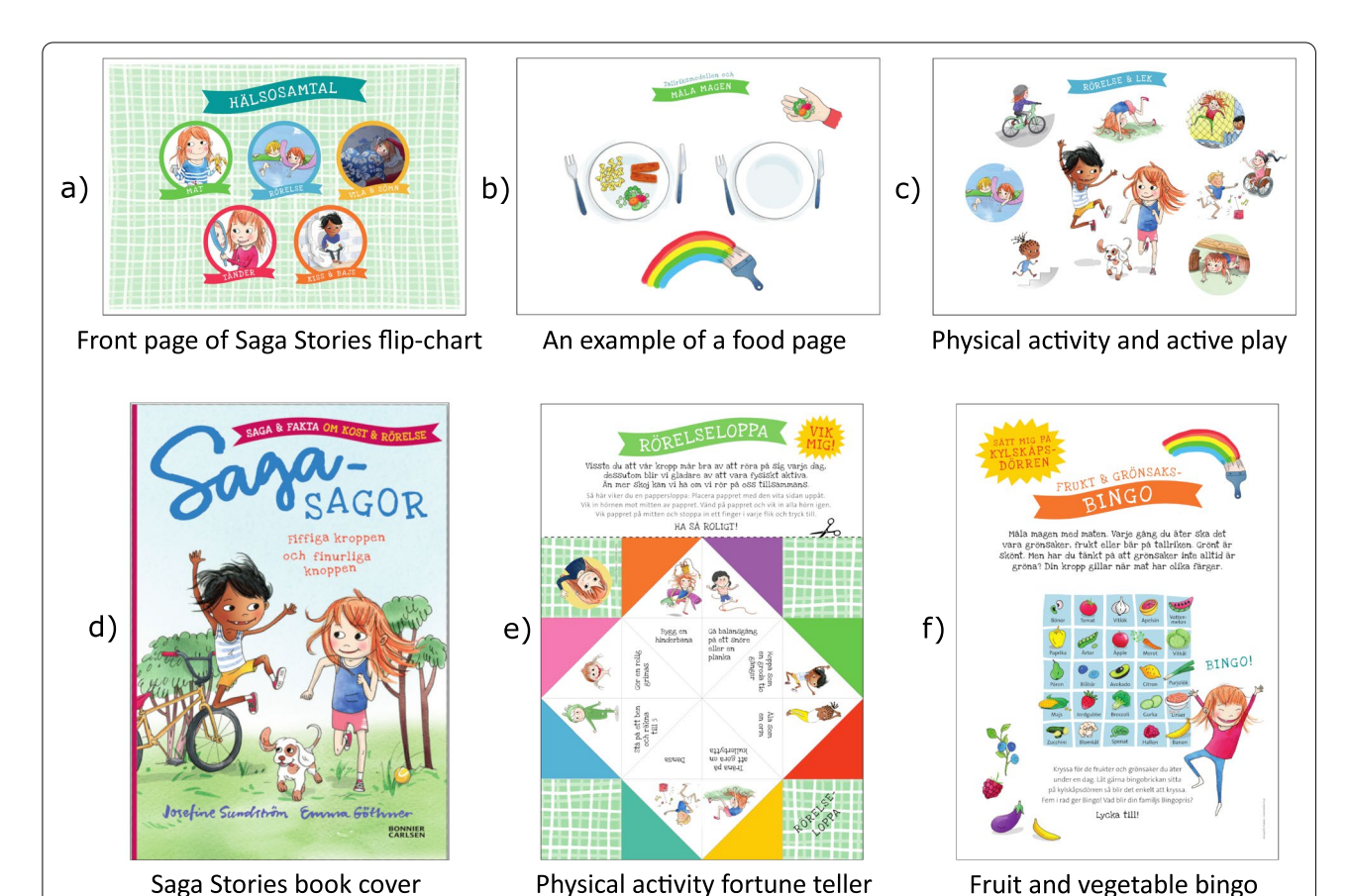
Fig. 2 Screen shots of the Saga Stories material illustrated by Emma Göthner. The top row shows example pages of the Saga Stories flip chart used by the child healthcare nurses to facilitate the health talk at the five-year routine visit. These include a) the front page illustrating the four topics (food, physical activity and sedentary behaviour, sleep, dental health, and bathroom habits); b) an example from the healthy food habits pages, and c) an example of the physical activity and sedentary behaviour pages in the flip chart. The bottom row shows the take-home material that is given to the families at the visit: d) the Saga Stories book, e) the physical activity fortune teller, and f) the fruit and vegetable bingo

most applicable to that family and tailor the health talk using the 'Saga Stories' material. For instance, if a family feels they are struggling with food and do not perceive physical activity and sedentary behaviour as a problem the majority of the health talk may be focused upon food. Thus, some health talks will include all subjects while others may only focus on one or two subjects. At the conclusion of the check-up the children receive the book `Saga Stories: Your amazing body and brain', which is an inspirational and educational book which the parents are encouraged to read together with their child. The parents are given a hand-out showing an ideal 24-hour period with regards to time spent sleeping, playing, being physically active, and using screens for five-year olds. They also receive games for the child to take home (fruit and vegetable bingo and a physical activity fortune teller), which are intended to promote healthy lifestyle behaviours. The intention of the games and book is to create curiosity and interest in the child (together with their parents) for new foods and active play. Figure 2 shows