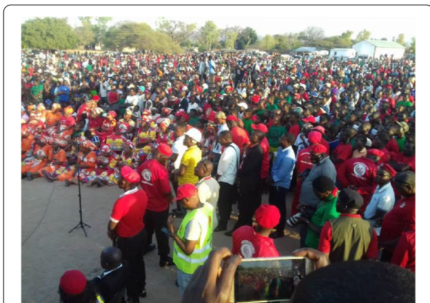
Fig. 1 Tonse alliance political rally in Lilongwe city, Malawi, amidst COVID-19 epidemic. Photo credit: research participant, June 20, 2020

We conducted the study in three urban cities of Malawi, namely Mzuzu, Lilongwe and Blantyre, where cases of COVID-19 are high [3]. Malawi is situated in the southern part of Africa, bordered by Tanzania to the north, Mozambique to the southeast, and Zambia to the northwest (Fig. 2). Estimates show that Malawi has a total population of 19,737,191 as of September 2021 [29]. Poverty is widespread across the country as more than half of the population lives below the poverty line (less than $1.90) and about a quarter are ultra-poor households [29]. Majority of the population work in the agricultural and informal sectors, which form the backbone of Malawi's economy besides foreign aid.