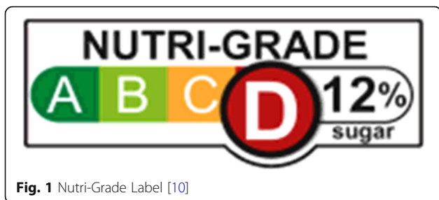
Fig. 1 Nutri-Grade Label [10]

The objective of this study was to obtain baseline data, and position ourselves to monitor future product trends in sugar and sweetener use in non-alcoholic beverages. This study uses package labelling data obtained from in-store surveys to investigate sugar and sweetener composition of NABs present on the Singapore market, as well as assess their future Nutri-Grade classification. The data collected in this study provide a point estimate (July–September 2020) on market composition and use of both sugar and artificial sweeteners in beverages prior to integration of the mandatory labelling requirements.