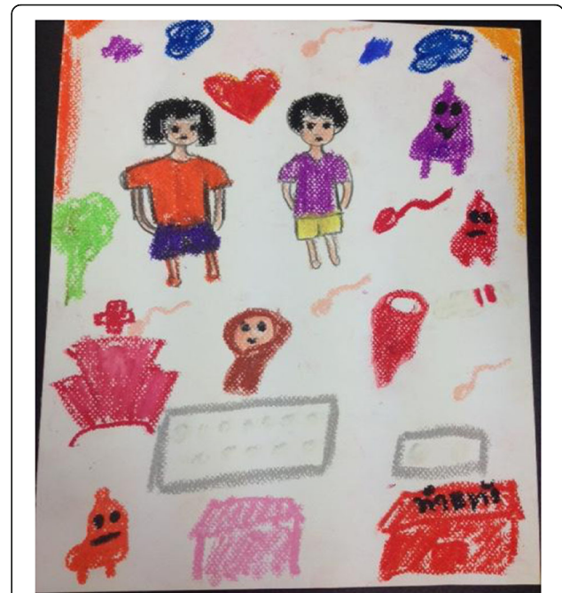
Fig. 1 Picture painted with dark red color, which suggests an abortion, aborted baby, and sad baby ghost due to being aborted. (Fig. 1 does not violate copyright; permission has been obtained from the student of the FGD)

Many students also believe that the spirit of the aborted child will come back and take revenge on the mother (Fig. 1). Aside from the person who aborts the baby, individuals who assist in providing advice, assist in taking the student to an abortion clinic and those who are providing abortion services are all taking part in bad