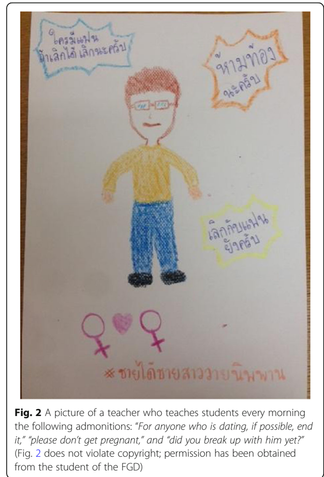
Fig. 2 A picture of a teacher who teaches students every morning the following admonitions: "For anyone who is dating, if possible, end it," "please don't get pregnant," and "did you break up with him yet?" (Fig. 2 does not violate copyright; permission has been obtained from the student of the FGD)

"I give them some bad examples of female students who became pregnant while in school; they are forced to leave school. Some of them did not continue their study [even after the pregnancy]. They had to