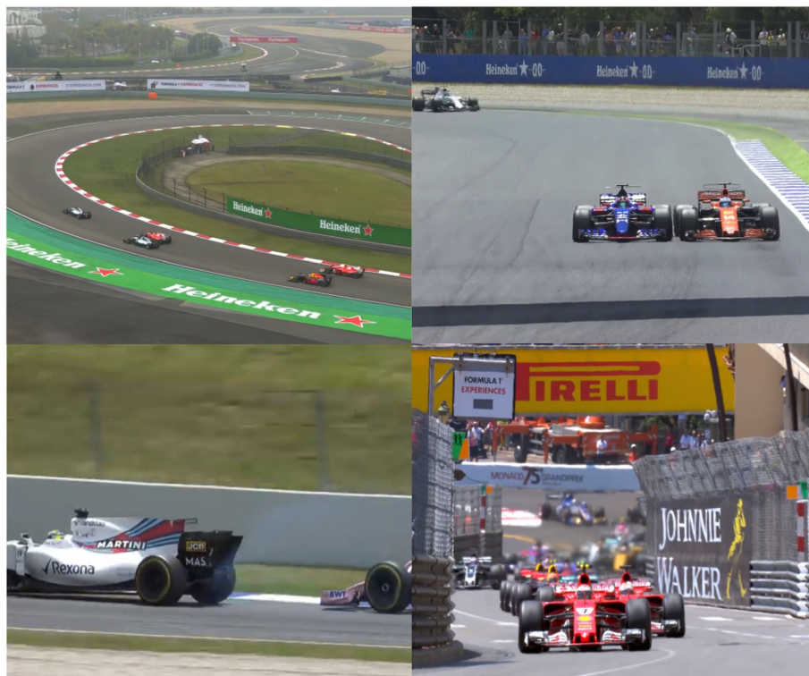
Fig. 1 Examples of alcohol branding in F1 broadcasts

Some alcohol producers associate their advertising with responsible drinking alibi messages, messages about responsible drinking while still promoting the alcohol brand by containing alcohol product trademarks. Alcohol industry messages about responsible drinking have been shown to be ambiguous and can serve a subtle public relations function, engendering goodwill with potential consumers of the brand while promoting brand preference and product consumption [16, 17]. Heineken's 5-year F1 sponsorship has been heavily criticised for, "linking a popular motor sport to a significant cause of avoidable physical, mental and social harm and more specifically one of the major killers on our roads, drink driving" [18]. This global campaign incorporates Heineken's characteristic red star and green branding with a