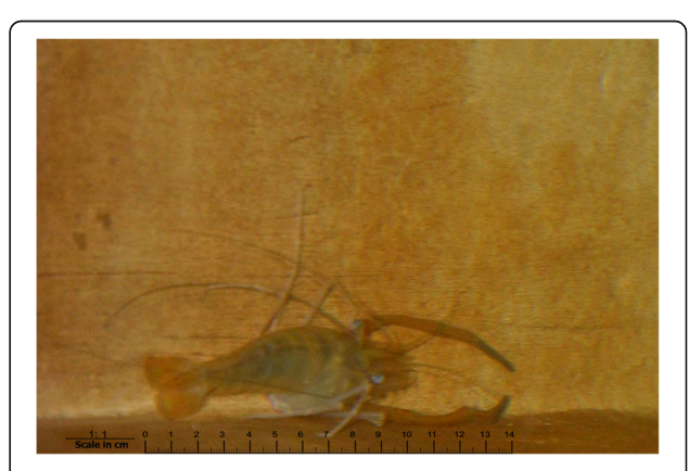
Fig. 3 Shrimp in a household water container