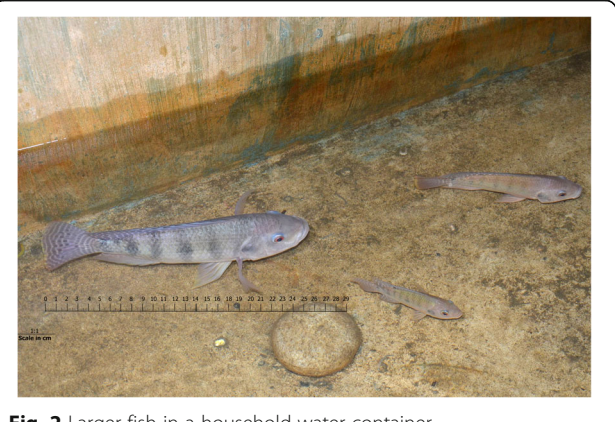
Fig. 2 Larger fish in a household water container