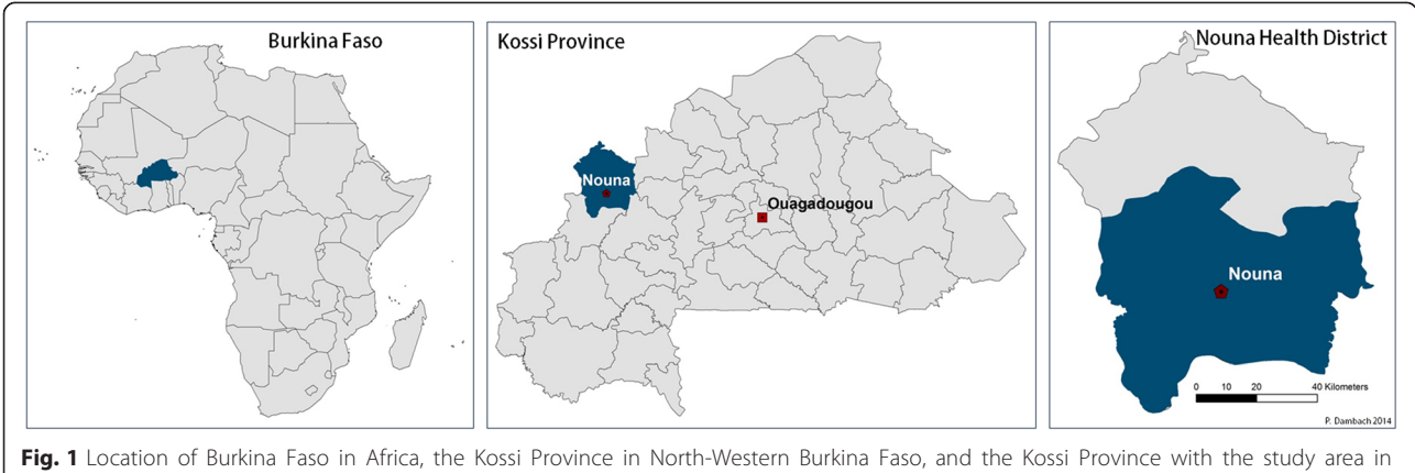
its southern part

The EMIRA project as a large-scale intervention covered the area of an entire health district, comprising a total of 127 rural villages and a semi-urban town, and therefore required a plethora of contributors in different professional disciplines and at different levels of hierarchy. The formation of an operations team was regarded as an important issue. An extensive training program with different modules was defined to suit the needs of different categories of personnel. Within the project, personnel for the following tasks were needed: 1) larvicide spraying and its supervision, including basic entomologic knowledge, 2) mosquito collection for assessing vector abundance, 3) testing for parasitemia in U5 children, 4) population surveys, 5) surveys on registered disease and death cases, 6) administrative tasks.