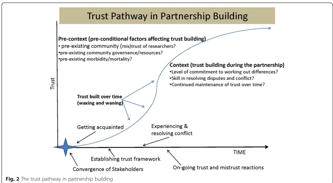
Fig. 2 The trust pathway in partnership building

The quotations in this section illustrate the complexity of building and maintaining trusting relations for partnership members as well as the role of history and pre-context. The trust analysis is depicted visually in Fig. 2,