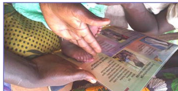
Figure 1 Using the counselling card to categorise newborn foot length as “very short” (<7 cm), “short” (7–7.9 cm) or “not short” (8 + cm) in Mtwara Region, Tanzania (here showing a newborn with “not short” foot length).

This was a cross sectional study of paired observations of newborn foot length, using the laminated counselling card, with one observation in each pair being done by a project researcher and the second by the community volunteers. In addition, the researcher and volunteers also measured foot length using a plastic ruler. Based on previous research [12] 50% of newborns were expected to have a foot length shorter than 8 cm (a proxy for birth weight less than or more than 2500 g). 143 observation pairs would be sufficient to estimate an expected kappa of 0.4 and its 95% confidence interval (indicating fair agreement between different observers using the same measurement tool) for rating newborns as having feet shorter or longer than 8 cm.