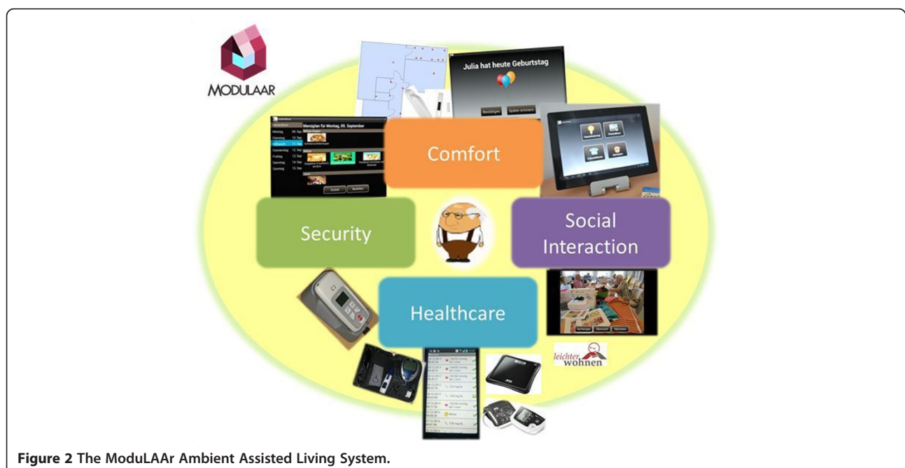
Figure 2 The ModuLAAr Ambient Assisted Living System.

Participants receive a healthcare package, which is based on NFC-gadgets (near field communication devices). The device to collect health related data is a smartphone with a pre-loaded software application developed