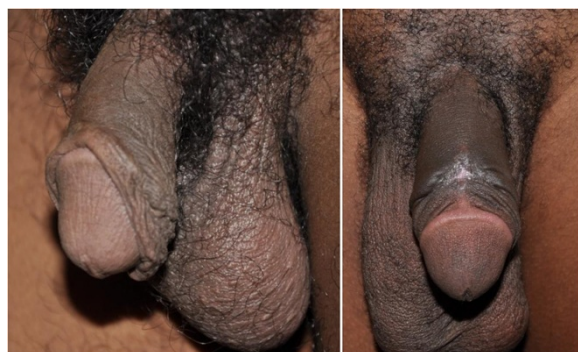
Figure 2 Longitudinal Foreskin cut: Variant (i) Foreskin cut but still partially covers the glans penis; Variant (ii) Foreskin cut and remains loose behind the glans penis.

MC for children was viewed positively. More than 90% of men and three quarters of women stated they would