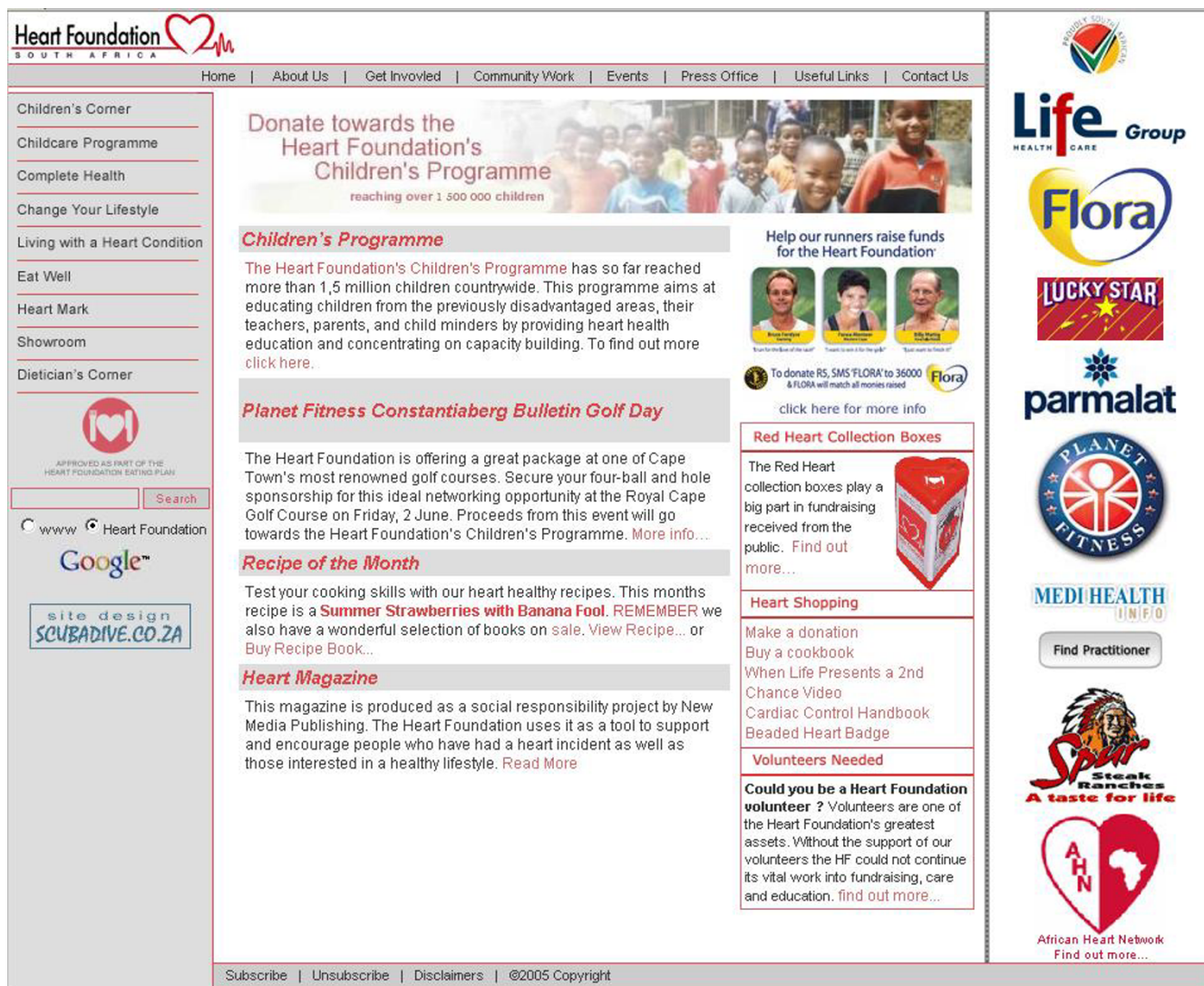
Figure 2 Screenshot of Heart Foundation of South Africa homepage with steakhouse sponsor logo.