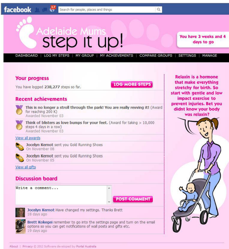
Figure 1 Screen shot of the Mums step it up Facebook app.

To be eligible women must be: 1) up to 12 months post-partum, whether it is their first or subsequent child; 2)