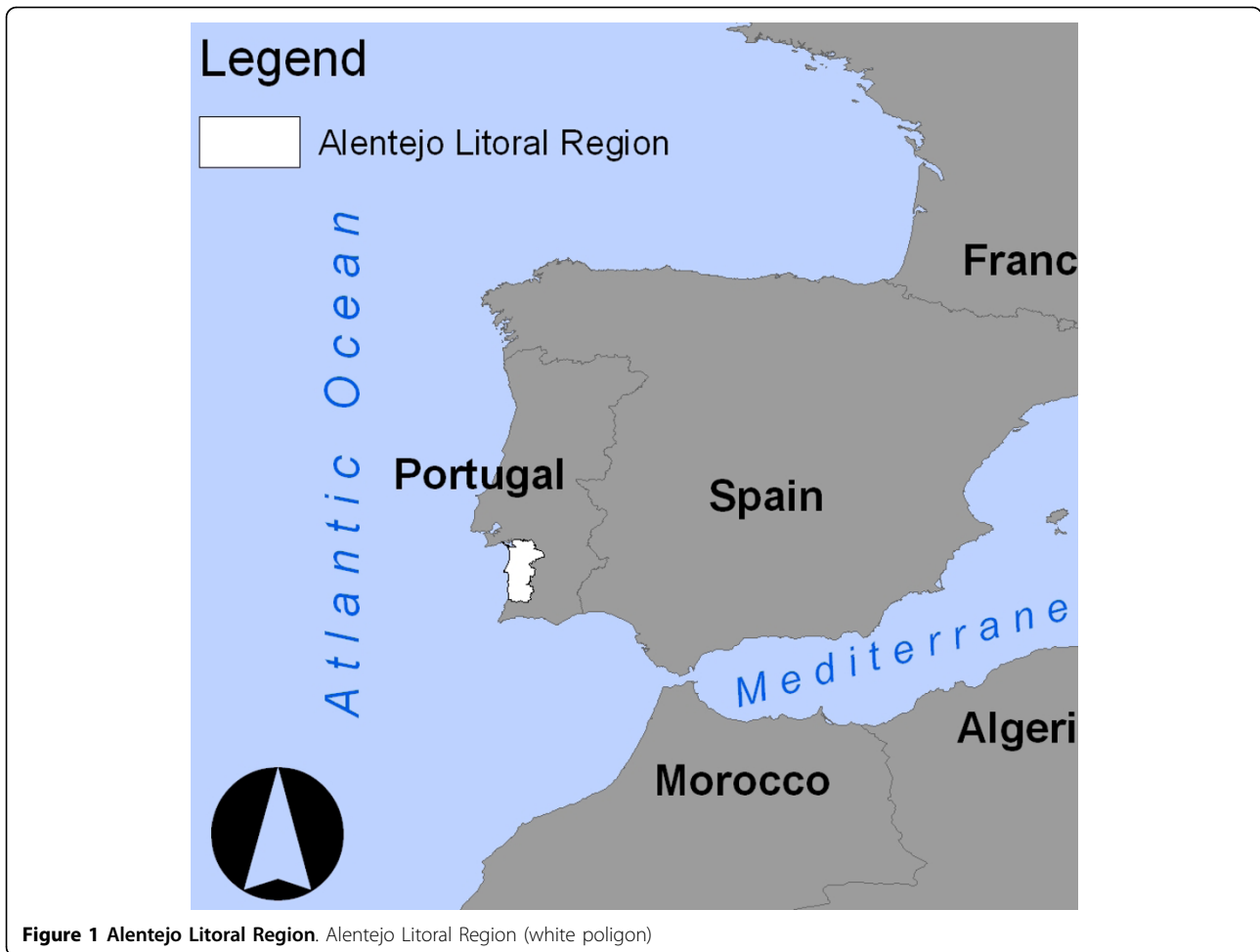
Figure 1 Alentejo Litoral Region. Alentejo Litoral Region (white polygon)

the spatial resolution adopted is adequate to capture main air pollution spatial patterns.