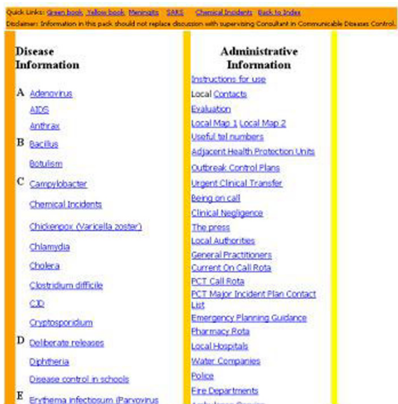
Figure 1 Structure of the on call pack as viewed on a PDA