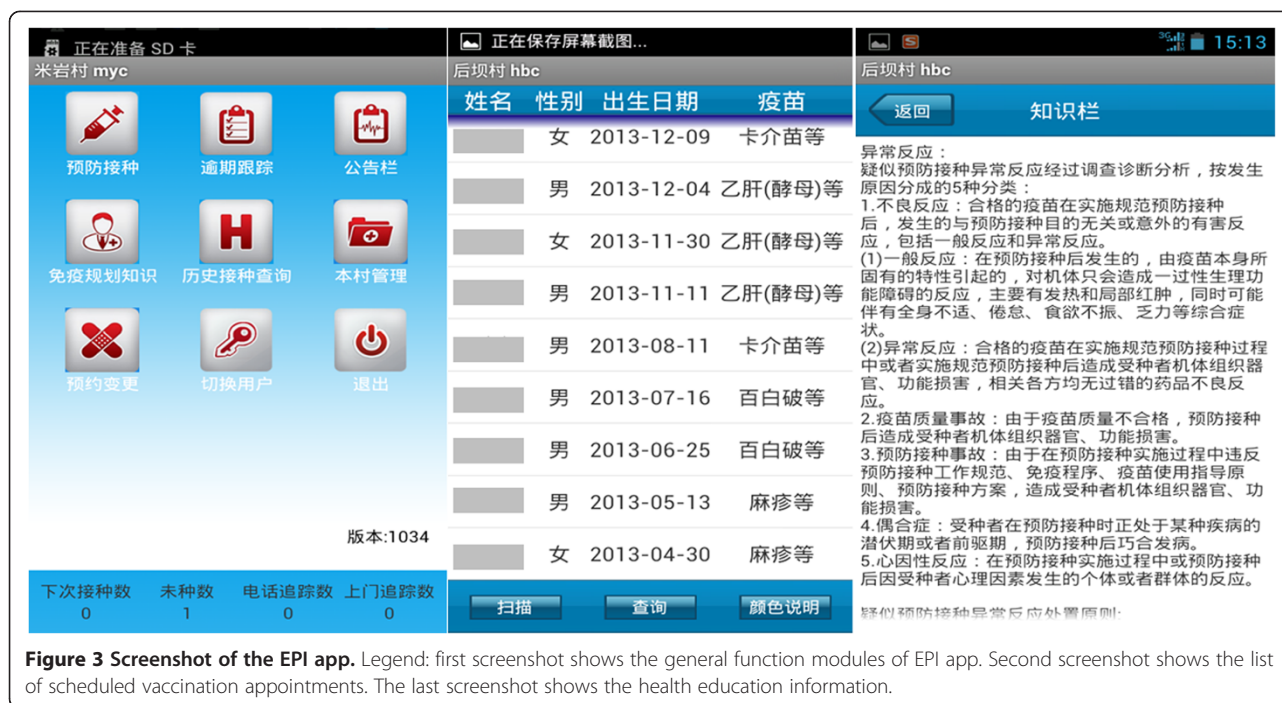
Figure 3 Screenshot of the EPI app. Legend: first screenshot shows the general function modules of EPI app. Second screenshot shows the list of scheduled vaccination appointments. The last screenshot shows the health education information.

intradermal and subcutaneous injections and send this to village doctors through this app. In this way, village doctors will learn knowledge about immunization at any time or any place.